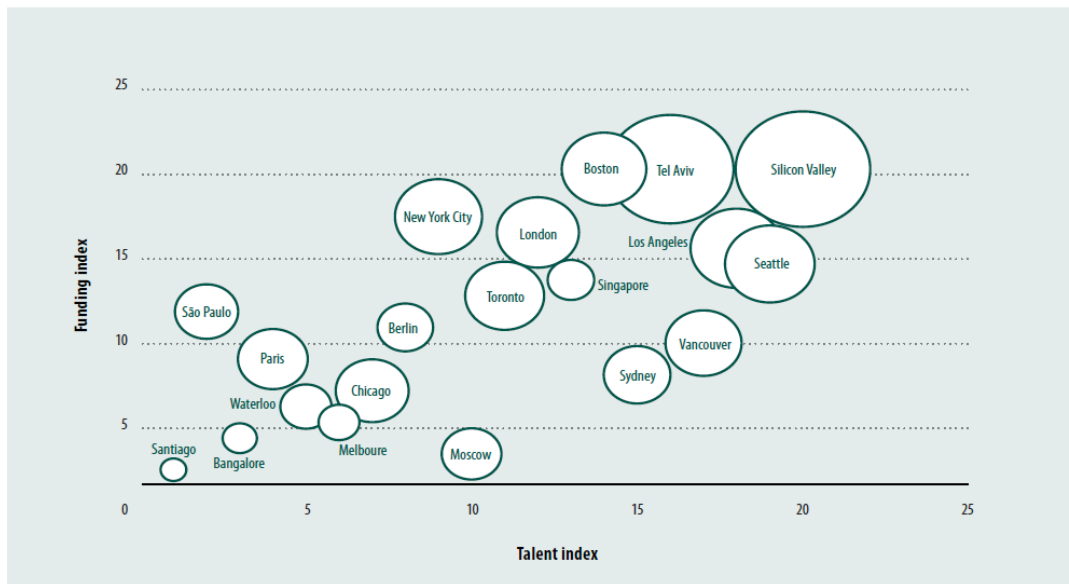
Figure 5: Top world start-up ecosystems, 2012

Source: Author's elaboration, based on Telefónica Digital and Startup Genome, 2012. Note: The bubble size indicates the positioning of each territory in the total ranking, where Silicon Valley ranks at the top (i.e., 20) and Santiago at the bottom (i.e., 1). In each index, Silicon Valley is assumed to be the reference and it ranks at the top (i.e., it scores 20). The funding index measures the availability of risk capital in each start-up ecosystem, while the talent index ranks the skills of the start-up founders in each territory, taking into account different variables including age, education, work experience, and industry domain expertise, among other factors.