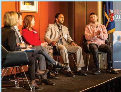
Above, Fierce Debate on Data in the sector at Parliament House NSW, 17 May 2018