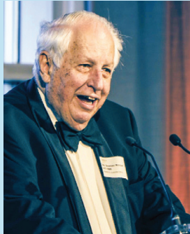
Sir Gustav Nossal – Research Australia Patron