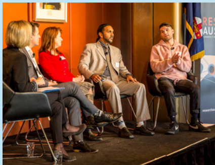
Above, Fierce Debate on Data in the sector at Parliament House NSW, 17 May 2018