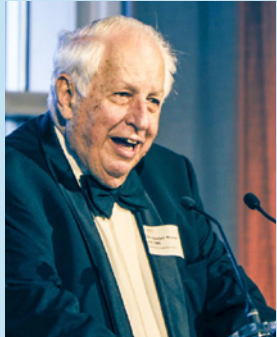
Sir Gustav Nossal – Research Australia Patron